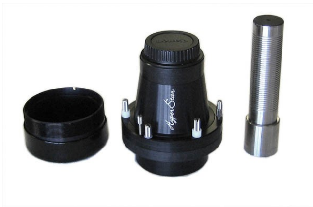
Secondary holder (shipped attached to lens), HyperStar lens, and counterweight