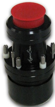
Holder capping the HyperStar