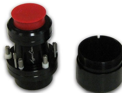
Holder removed to accept secondary mirror