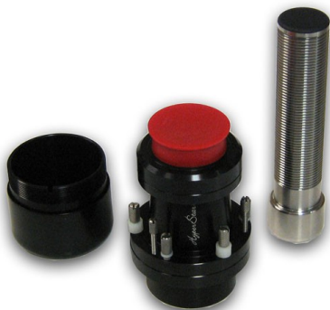
Secondary holder (ships attached to lens), HyperStar lens, and counterweight