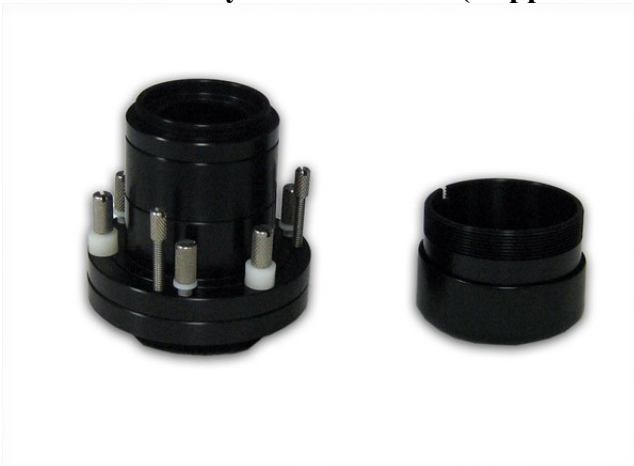
Secondary holder and HyperStar lens